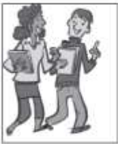
SIXTH FORM COLLEGE